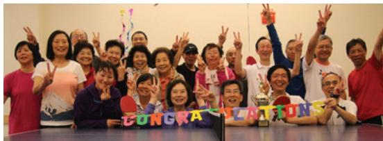
Table Tennis Tournament

Every year in July, Park & Recreation agencies throughout the country celebrate the programs and services they provide to their communities! This year is no different and the City of Milpitas has scheduled some fun activities in July to celebrate Park & Recreation Month! This year we would like to challenge you to explore the “undiscovered” roles of local parks and recreation, like senior programs, community celebrations, education and more! Make sure to look out for the “Lifetime of Discovery” poster located in all of the Recreation Centers to get activity dates and times!